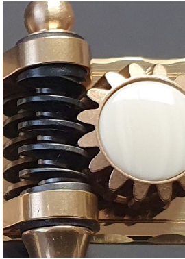
pecially mounted worm gear in the bearing blocks