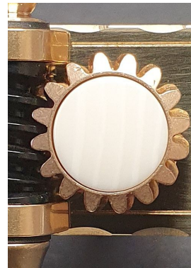
resistant and wear-free gear made of bronze ratio 1:16