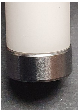
rollers with ball-bearing