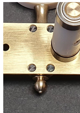
Parts are screwed instead of riveted