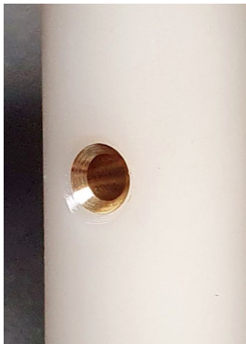
String hole with metal insert